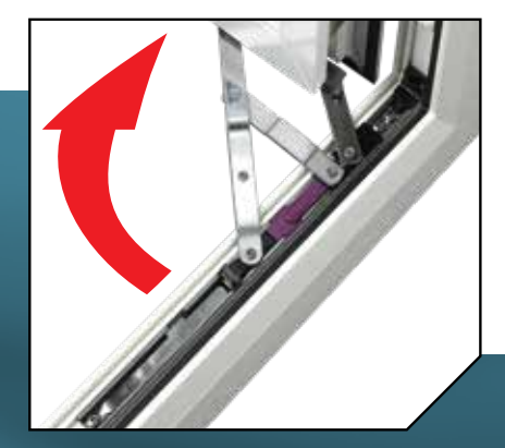
The Easy-Clean hinges enable the sash to be opened at 90 degrees