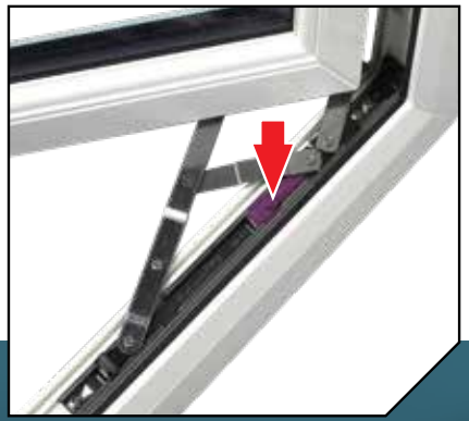
By pressing down on the purple button, the sash is released and can slide along it's hinge runner